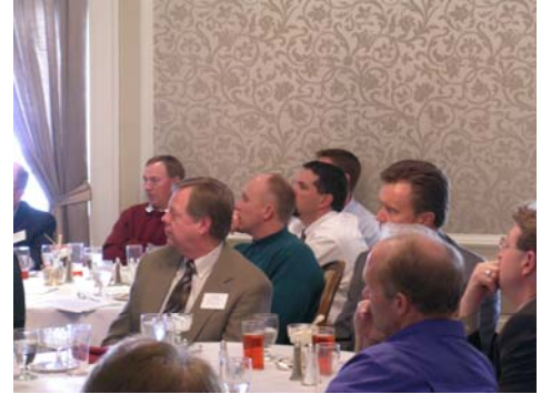
Directors filled the room

Getting back to business following the holidays, key leaders from public, private, and non-profit organizations packed into the Alta Club to enjoy lunch while probing issues surrounding executive Compensation and the Board's role in setting compensation.